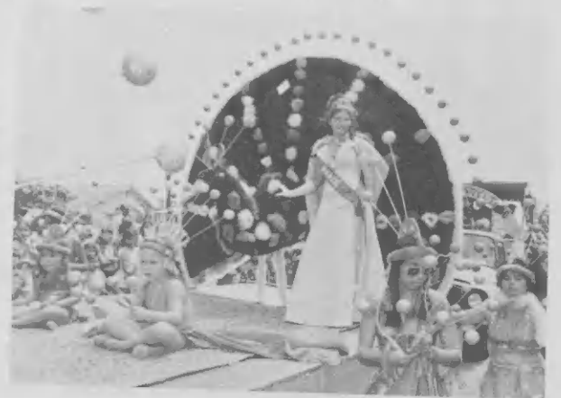
Brazil District Queen